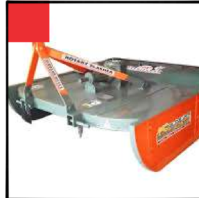
Slasher repairs for Polokwane Municipality