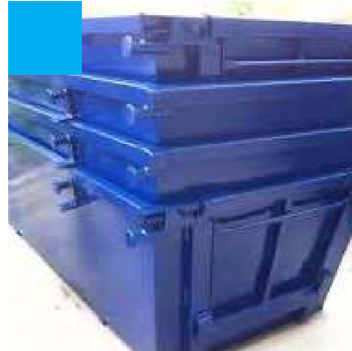
Skip bin repairs for ABInBev (SAB) Polokwane Plant