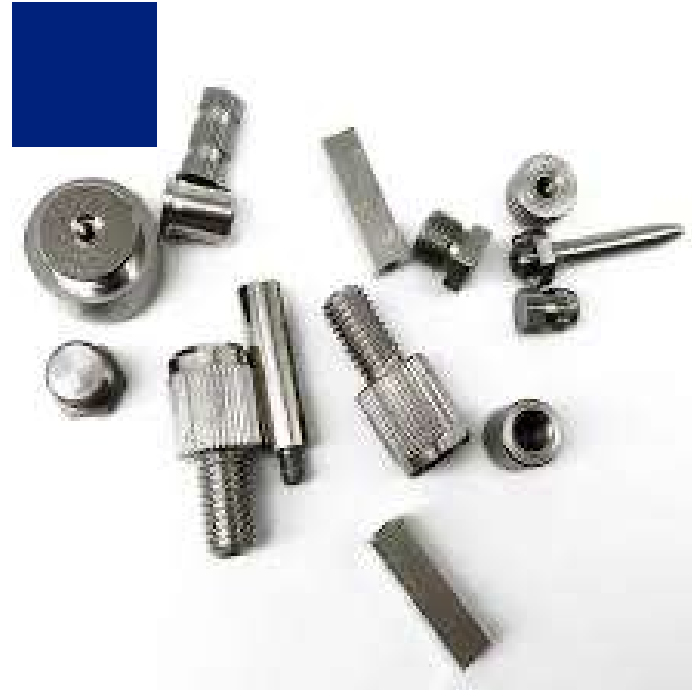
Engineering jobs completed