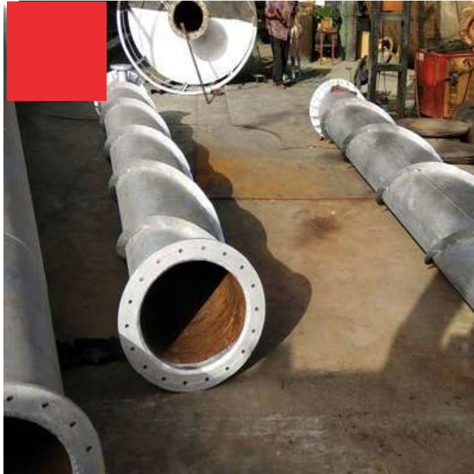
Chimney Fabricated for SAFCOL Timbadola Plant