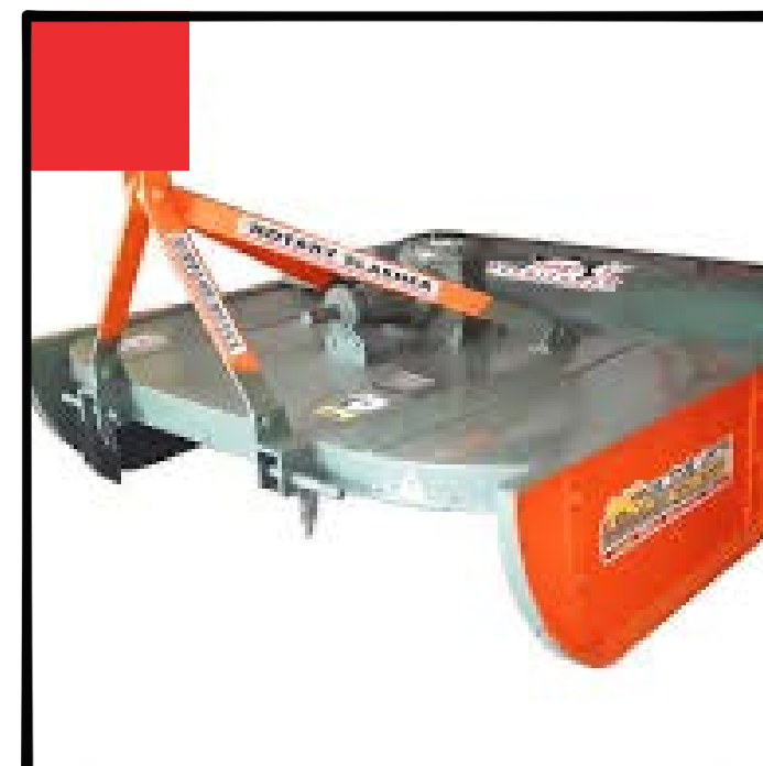
Slasher repairs for Polokwane Municipality