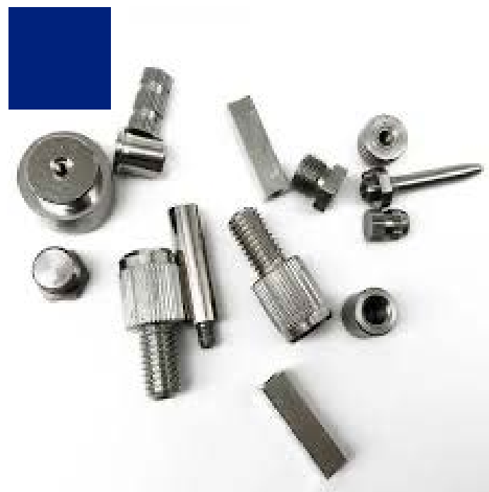
Engineering jobs completed