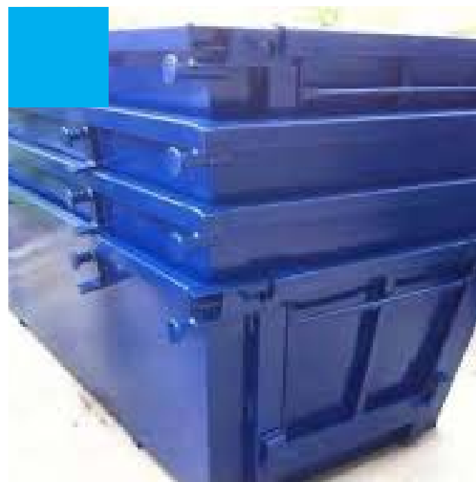
Skip bin repairs for ABInBev (SAB) Polokwane Plant